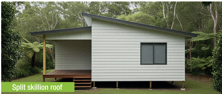
Split skillion roof